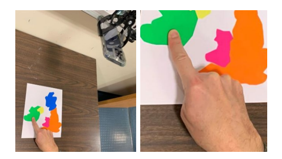
Fig. 2. Left: Experimental setup shows iPhone 14 Pro mounted above the British Isles tactile map in cellphone holder with the user making a pointing gesture on the map. Right: close-up of pointing gesture. The five levels of text labels for the region being pointed to are: "Republic of Ireland"; "2: Capital is Dublin"; "3: Population 4.9 million", "4: Area 27133 square miles", "5: Limerick is another city in Ireland".

participants. We used the feedback from these pilot experiments to iteratively debug and improve our interface. Notably, we relaxed our definition of the pointing gesture so that it admitted a pointing gesture in which the non-index fingers are not curled as tightly as shown in Fig. 2. The interface and experimental protocol were fixed after these pilot experiments. We then conducted formal experiments with six more BVI participants, P1-P6, ranging in age from 36 to 74 years old (3 female/2 male); we excluded a seventh BVI participant from our analysis because of inadvertent deviations from the experimental protocol. All experiments were conducted under an approved IRB protocol.